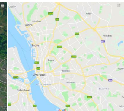
A map showing the same area of Liverpool